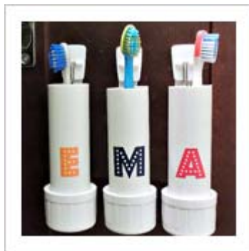
Clever Bathroom Storage From Pipe