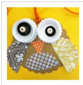
Whoop, Whoop Wants An Owl Craft Idea?