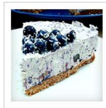
Blueberry And White Chocolate Cheesecake

You haven't started pinning on Pinterest yet and you want to get started? If so, click here .